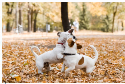
Suitable for outdoor