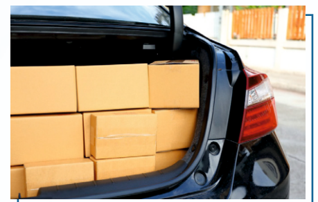
Easy for transportation